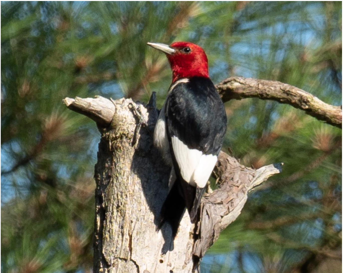
Red-headed woodpecker