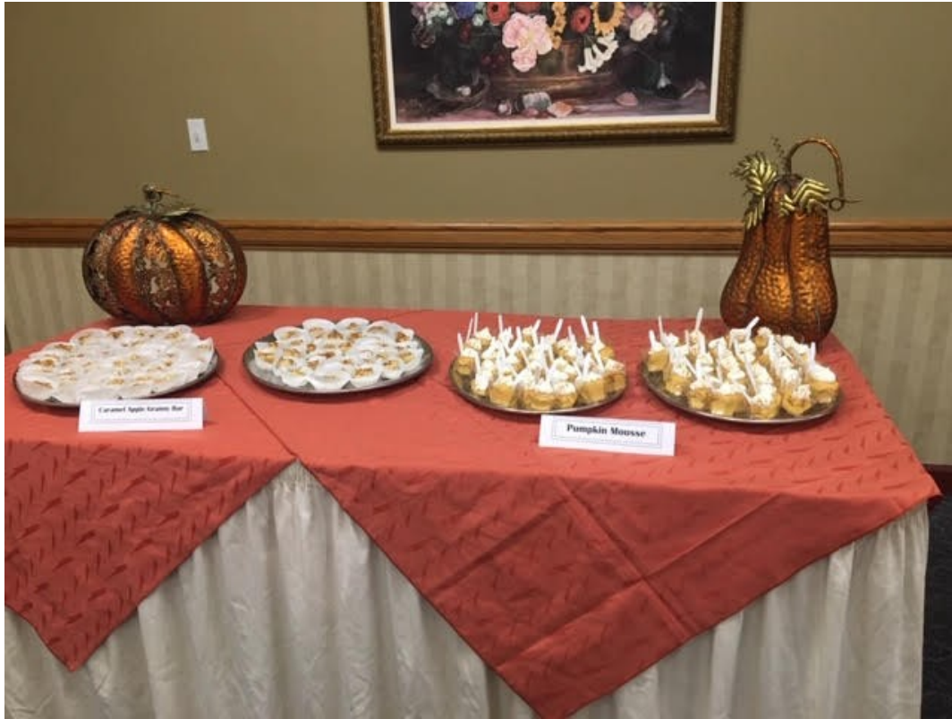
TREATS FEATURING PUMPKIN