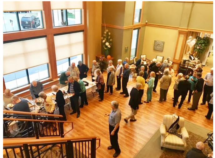
LINING UP FOR SOME OF THE DELICIOUS FOOD