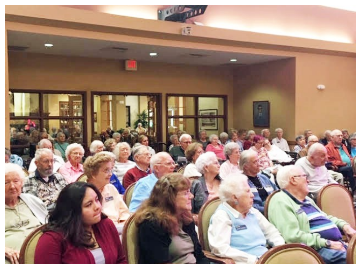
AUDIENCES LISTEN IN RAPT ATTENTION TO THE ORCHESTRA